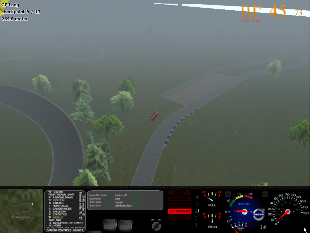
Aerial view of Volvo bus accident.

This mishap caused team Volvo to place last (3^{rd}) in the race.