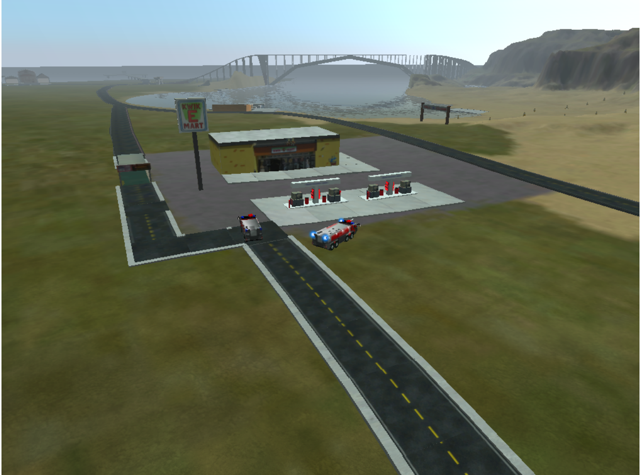
Aerial view of fire engines on scene, sometime after the explosion.

An explosion occurred near the Bakers Ranch fuel station, the fires were quickly subdued by fire engines from the near by station, relatively little damage was sustained.