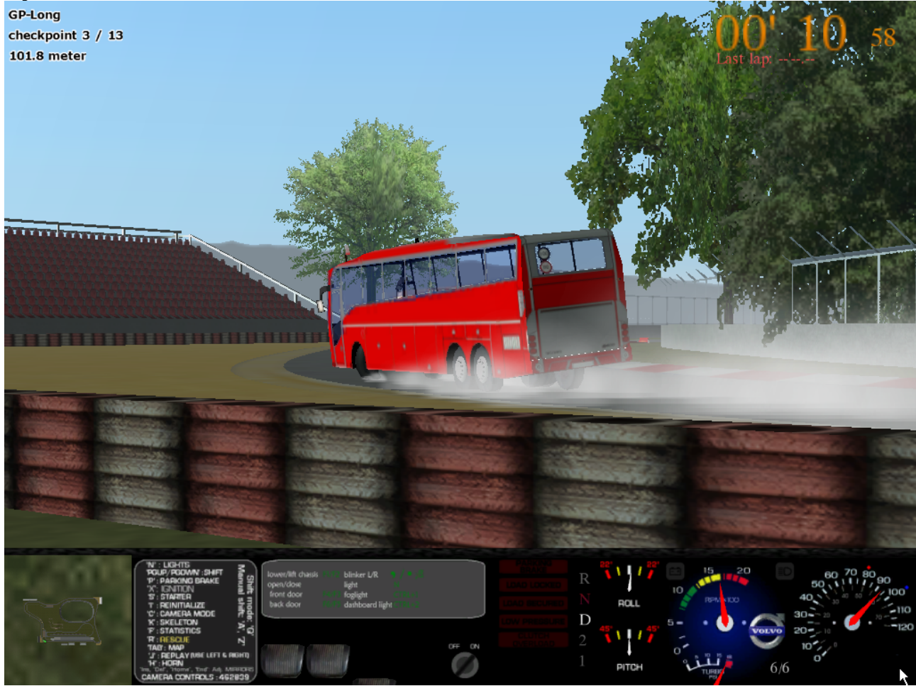
Volvo's Team bus handling the first corner at high speed.

The bus race at the F1 test track ended in horror for Volvo. Their team got off to a good start for the first few checkpoints, leading by several seconds.