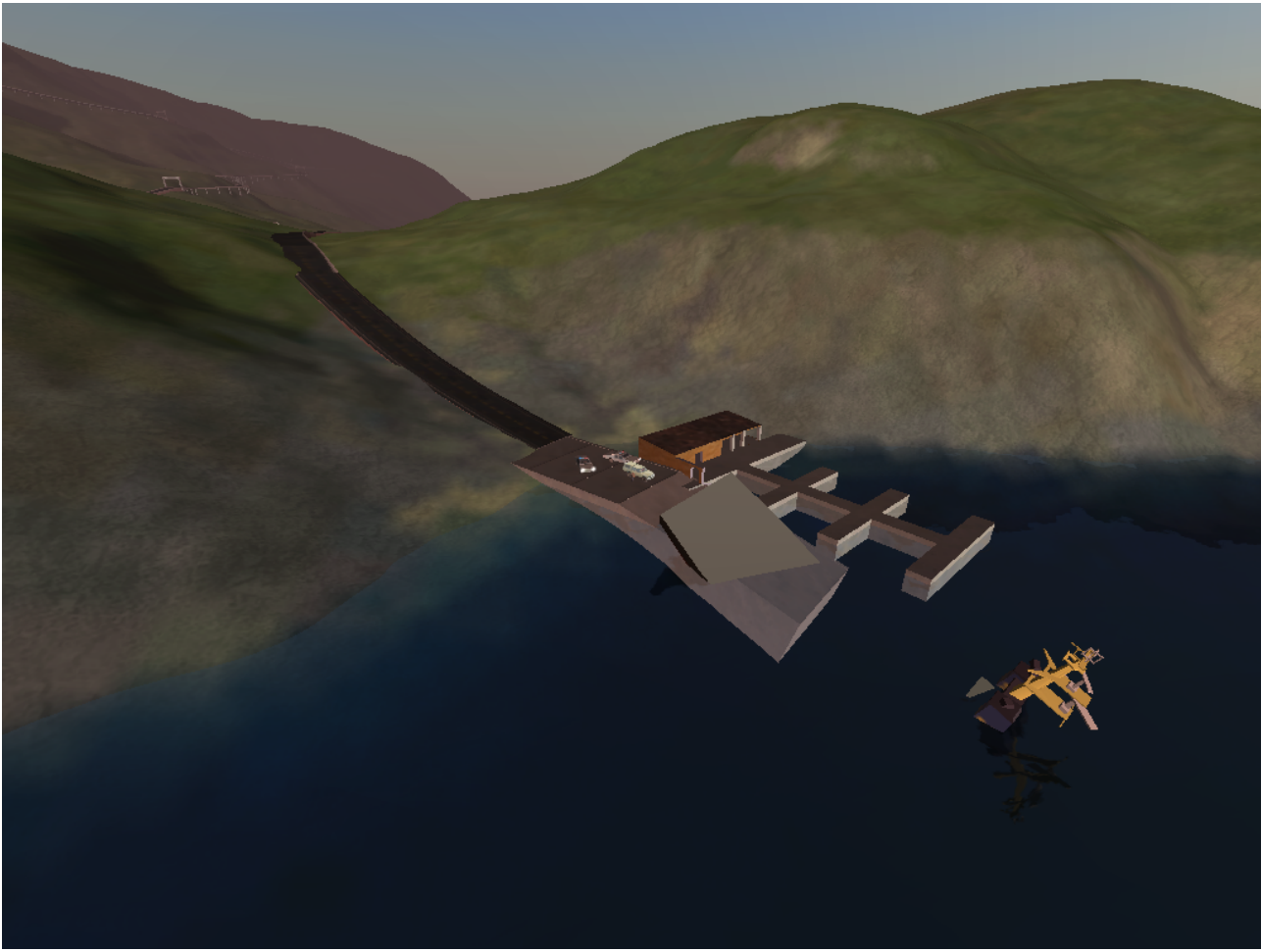
Police arrive at the scene of the incident.

A boat sank early last night at its mooring on the Island, it appears the boat had drifted into the mooring and had damaged its underside, causing a hole to appear, which apparently sunk the ship.