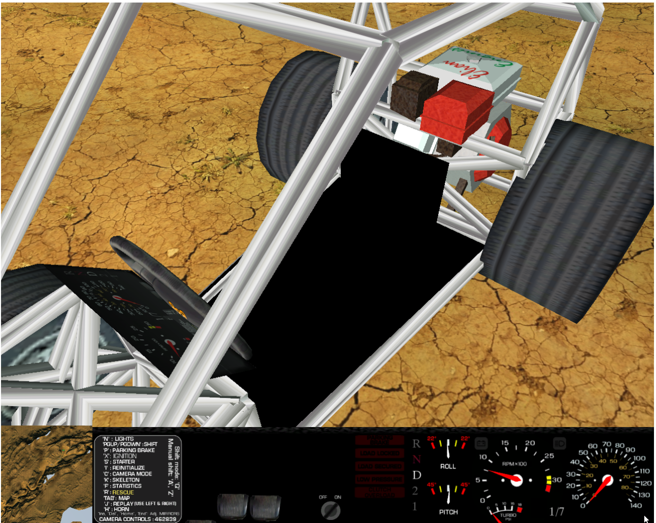
Close view of GoKart Chassis by TheTitan08, Engine by Elian.