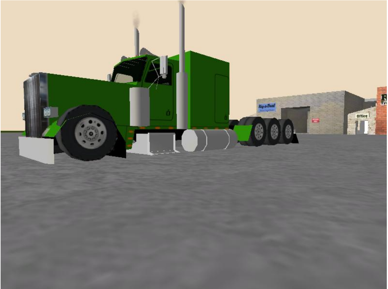
Picture of new low riding truck